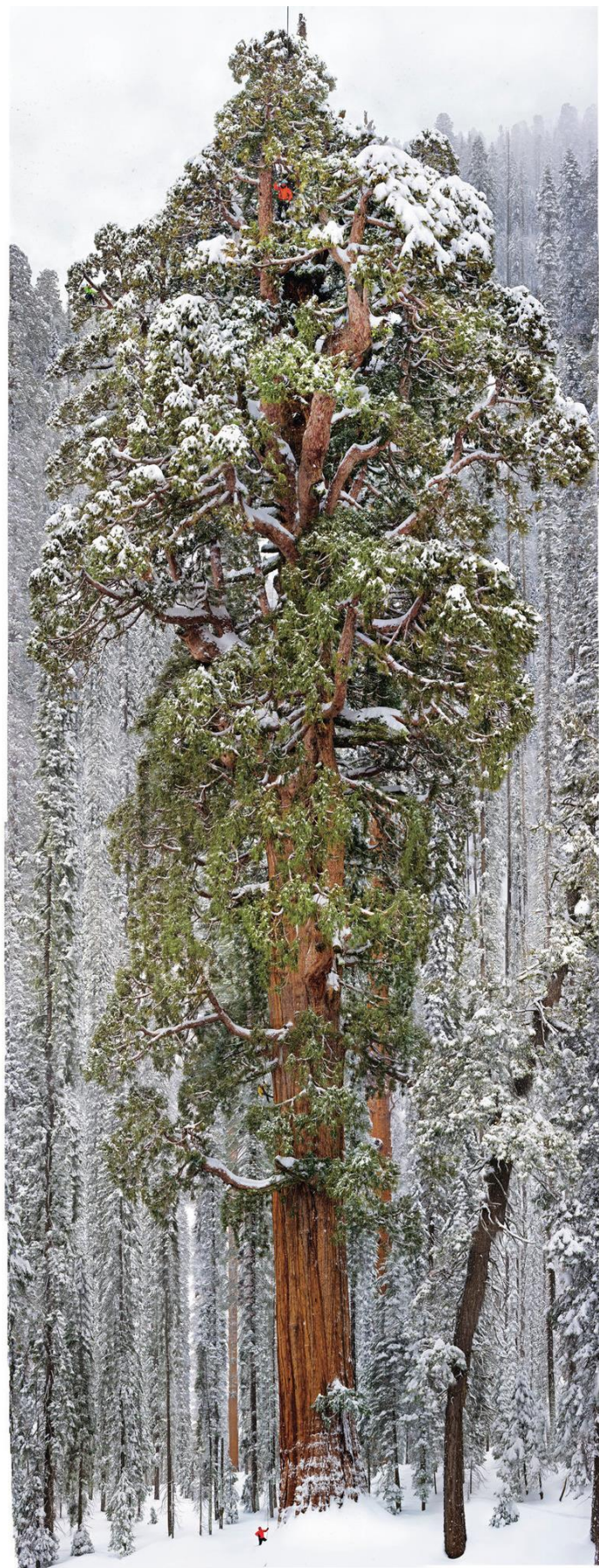
Sequoia President tree is 3,200 years old! National Geographic photographers combined 126 frames to create this photo!

This Editor grew up in Eureka CA, but never knew the difference between the Sequoia and the Redwood until now! The giant Sequoia is among the largest life forms on Earth, growing as tall as 83 meters (272 feet). Just think, some of these majestic trees were already alive 1,000 years before the birth of Jesus! Did you know that the tree was first described by a German-speaking botanist born in the Austro-Hungarian Empire in 1804? Stephan Endlicher reportedly named the genus Sequoia but never explained why. The speculation offered by later writers was that he was inspired by the achievements of the American Cherokee Indian linguist Sequoyah. The trees that grow on northern California's foggy coast are commonly known as Redwoods, while those in the Sierra Nevada mountains are called Sequoias.